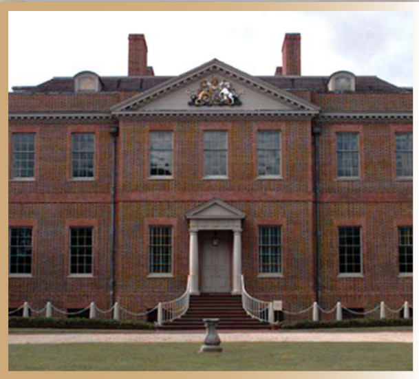
Tryon Palace, New Bern, N.C.

Governor Bev Perdue State of North Carolina