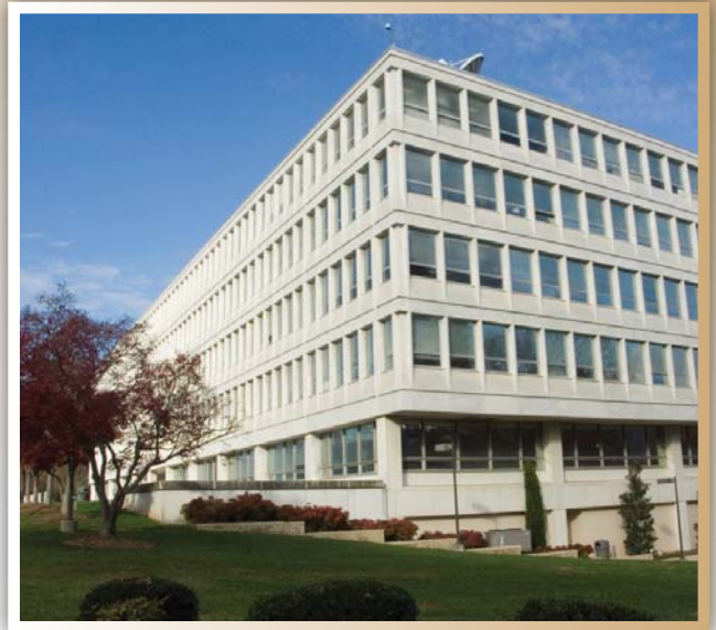
Administration Building, Raleigh, N.C.

The Ecosystem Enhancement Program acquires property mostly by easement for the preservation of wetlands and stream systems for water quality protection to offset any environmental damage done during construction of roads and to adhere to the mitigation requirements for highway construction projects.