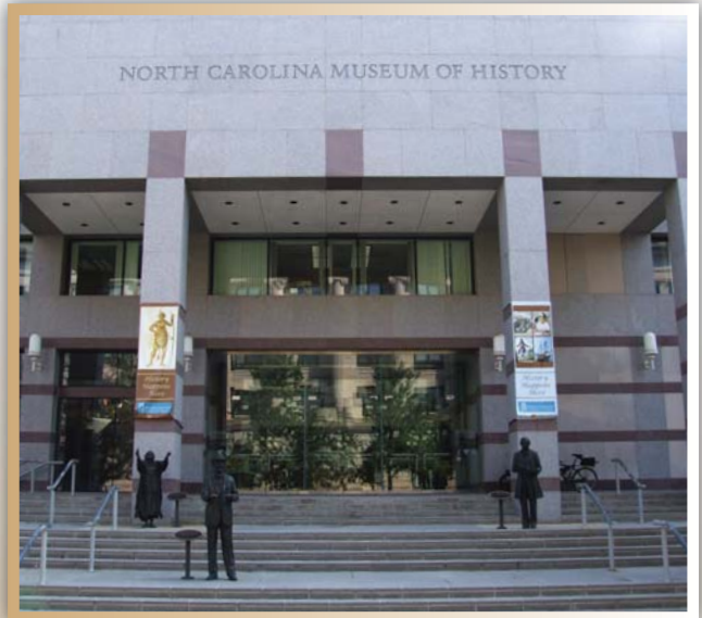
N.C. Museum of History, Raleigh, N.C.

In accordance with General Statutes 143-341 and 146, the State Property Office administers the acquisition and disposition of all state land or interest therein by deed, lease, easement, condemnation or otherwise for all state agencies. The State Property Office also (a) allocates and reallocates land, buildings and space in buildings among state agencies, institutions or departments, (b) maintains a complete and accurate inventory of state lands and buildings, (c) manages the state's submerged lands and vacant and unappropriated lands, and (d) provides clerical support for the Capital Planning Commission.