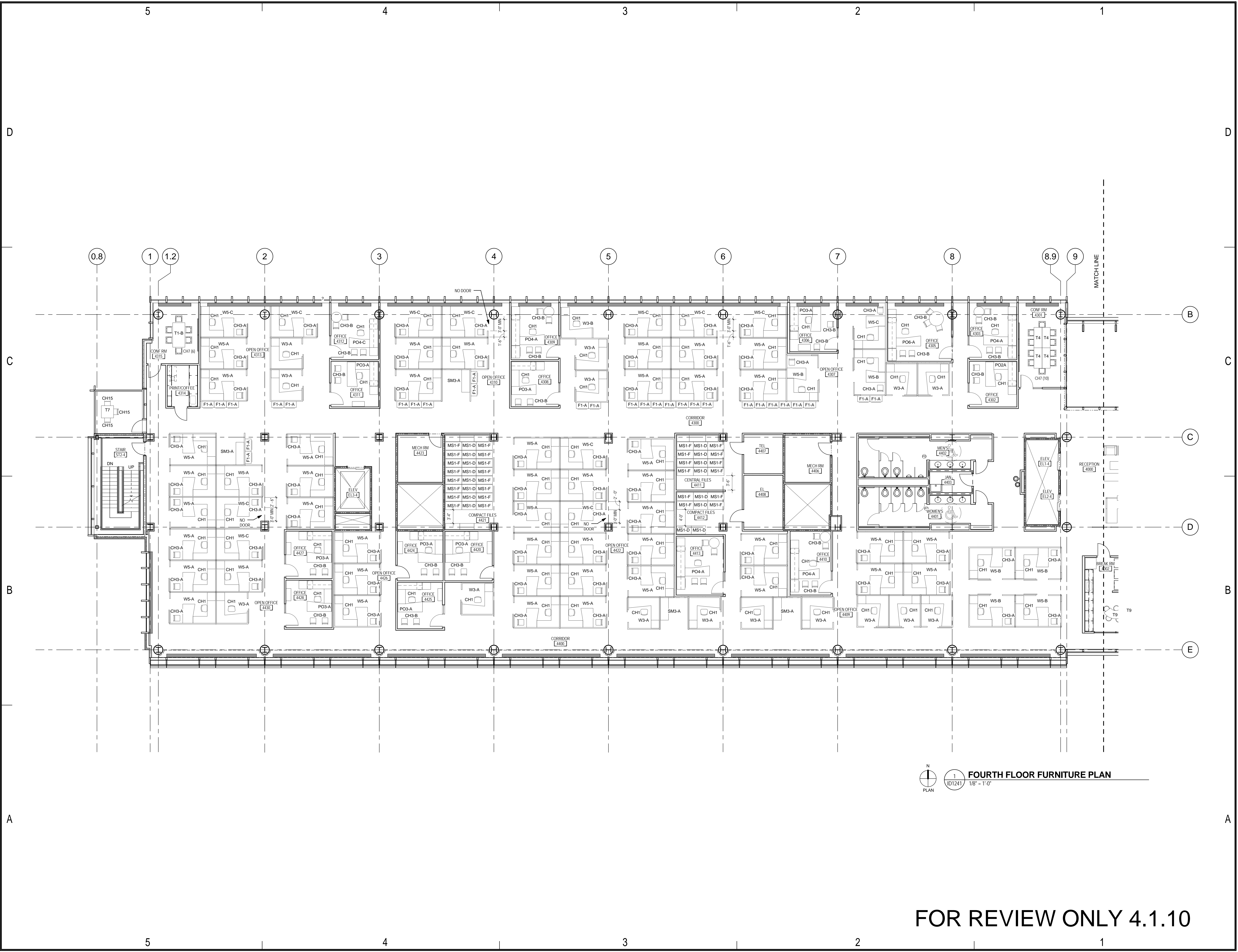
FOURTH FLOOR FURNITURE PLAN PLAN