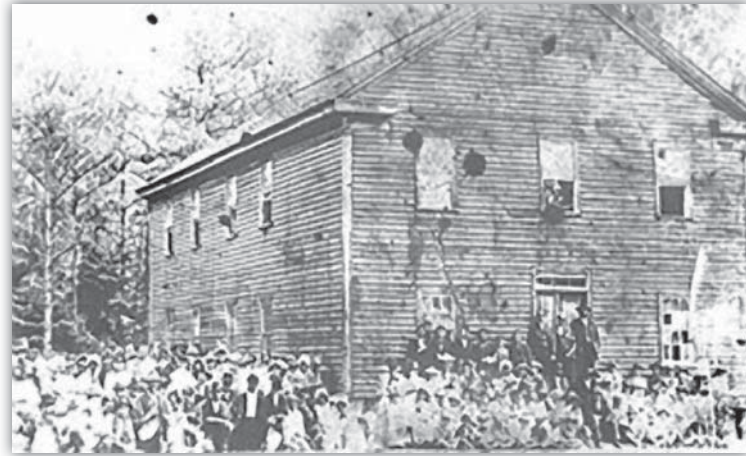
Pembroke State College for Indians in 1941.

In 1972, the General Assembly established the 17-campus University of North Carolina with Pembroke State University as one of the constituent institutions. The Board of Governors approved the implementation of master's programs in professional education at Pembroke State University in 1978, as well as several new undergraduate programs. Since that time, additional baccalaureate programs have been added, including nursing. Master's level programs have been implemented in Business Administration, Public Administration, School and Service Agency Counseling.