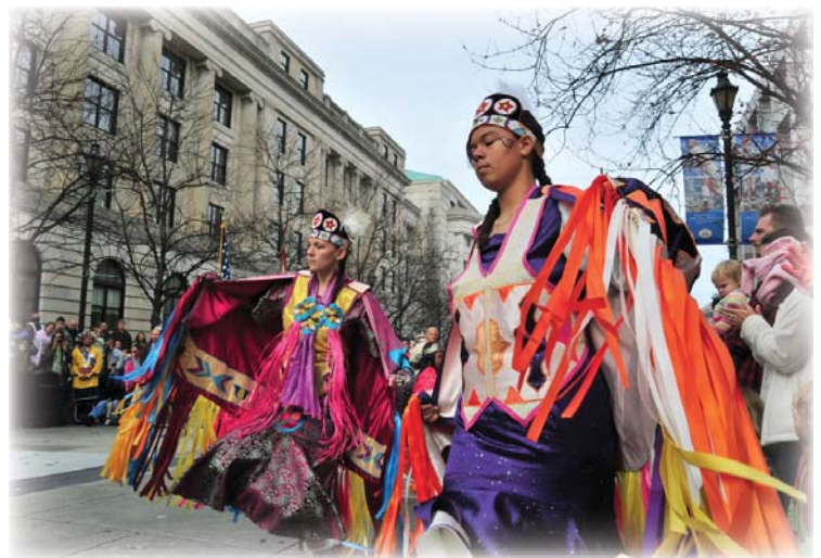
Tribal dancers during the Indian Heritage Month Celebration Grand Entry in downtown Raleigh.

17th Annual American Indian Heritage Celebration N.C. Museum of History Raleigh Contact: 919-807-7979