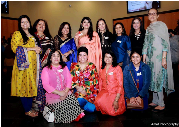
Outreach at Kiran Cultural Event