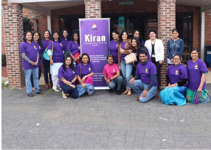
Kiran Charlotte Volunteer Chapter- Statewide Expansion