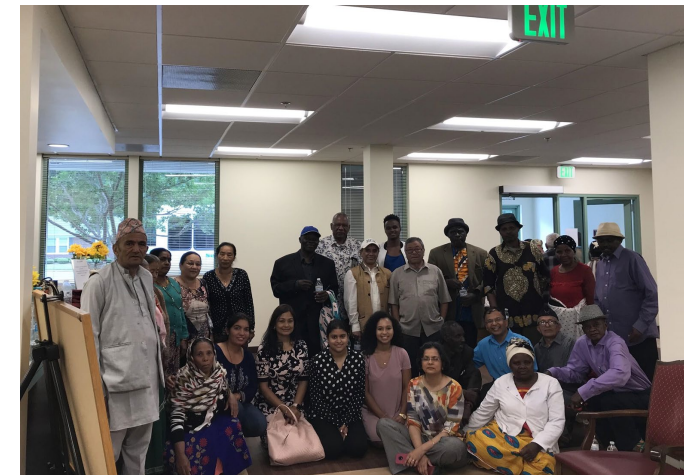
Kiran Elder Abuse Training