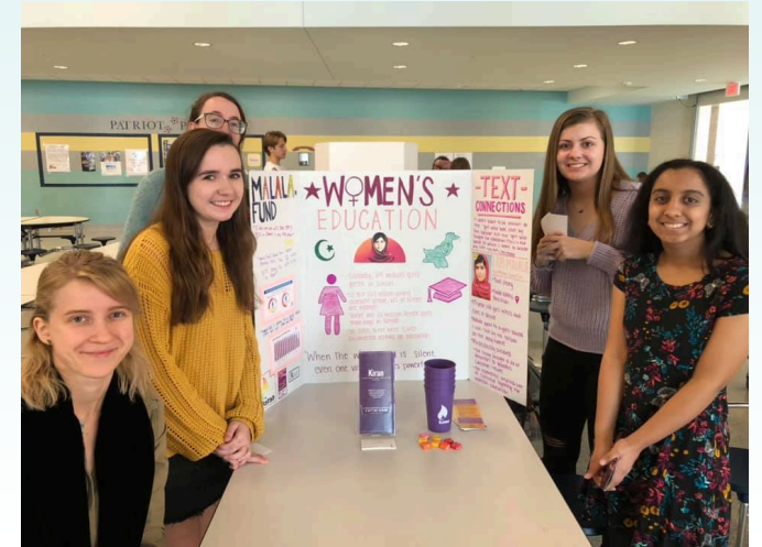
Apex Friendship High School Outreach