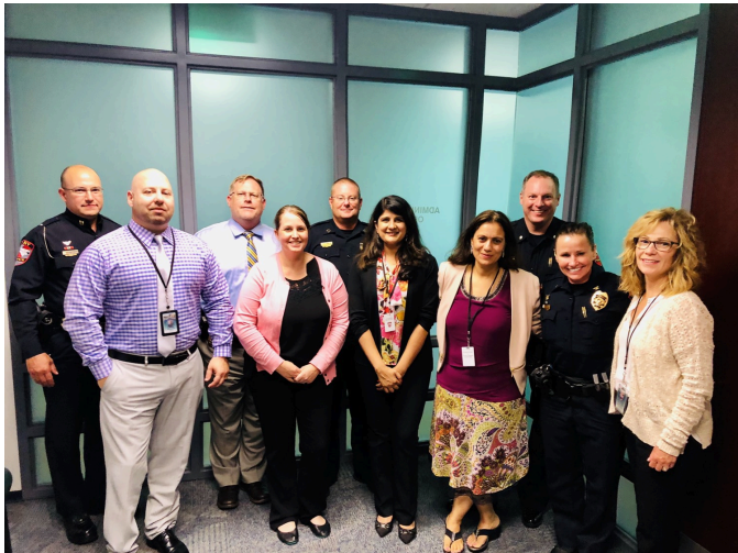
Cary Police Department Outreach