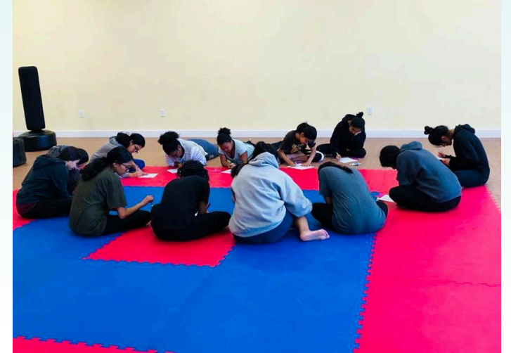
Teen Self Defense Workshop