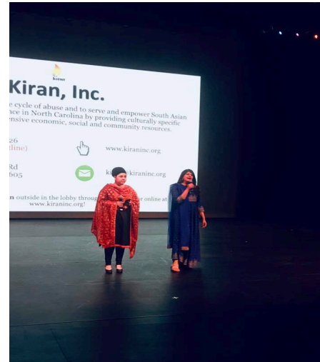
NC State University Outreach Event