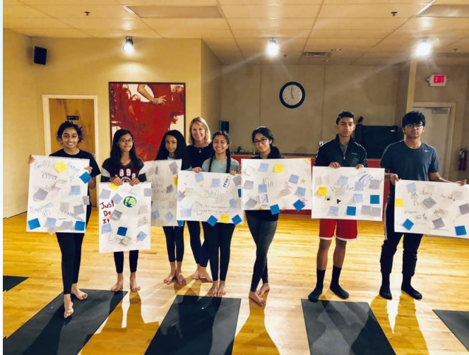
Teen Yoga Empowerment Workshop