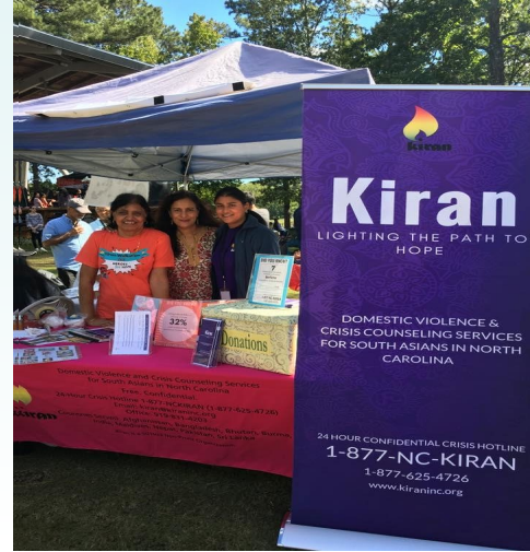
Cary Diwali Cultural Outreach Event