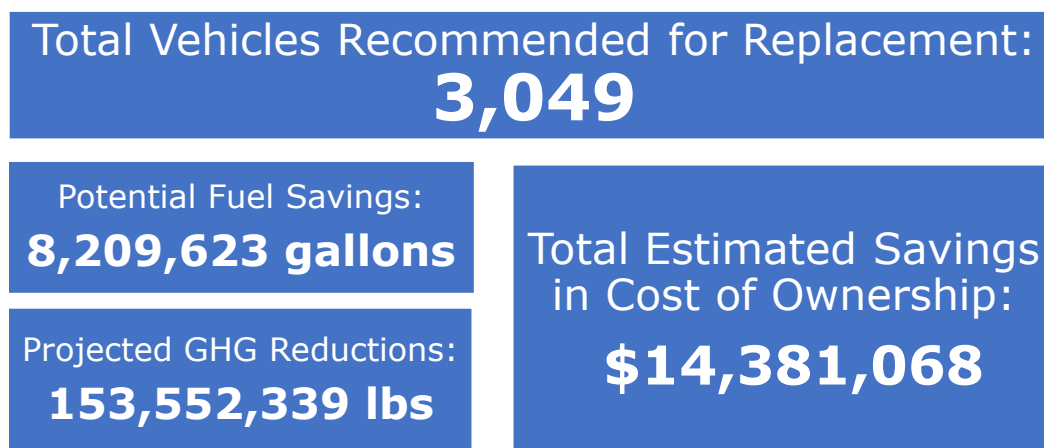
Figure 1. Summary of Sawatch analysis major findings for increasing use of ZEVs in NC's State Motor Fleet.

Sawatch Labs also assessed the potential aggregate charging demand across the state's fleet for all vehicles identified as suitable for an EV replacement, to help the state determine the location of charging infrastructure for optimal utilization. Based on driving data and the assessment of parking locations for potential EV replacements, Sawatch concluded where charging infrastructure would be most beneficial for the fleet and projected peak charging demand.