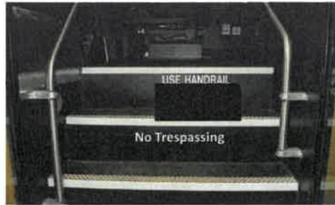
Separated decal location higher, out of the kick zone

Entrance step shall extend below skirt line to such depth as necessary to make the distance to the ground from the bottom of the step no less than 10 inches and no more than 14 inches.