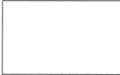
Thomas Seat Securement